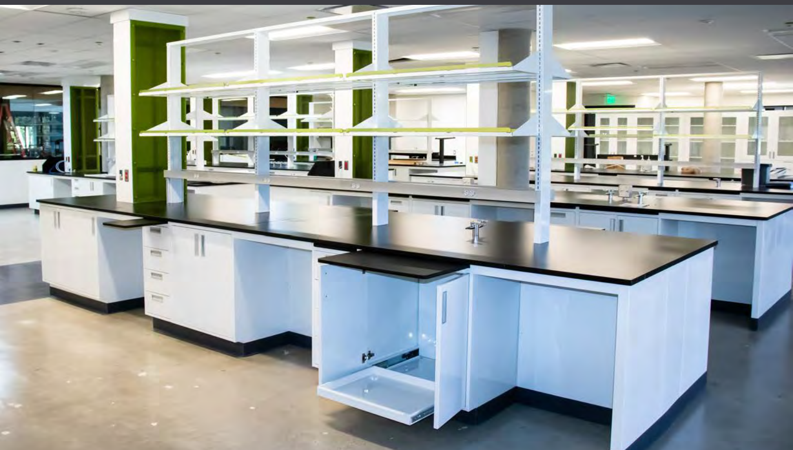
Customer: Undisclosed to protect the privacy of client Lab Furniture: Fixed Lab Islands with Modular Shelving, Workbenches, Sink Cabinets, Stainless Steel Sinks, Acrylic Drying Racks Top Material: Phenolic Resin (Lab Grade - Carbon Black) Color: White (RAL 9016)