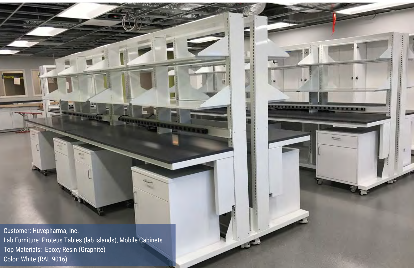
Customer: Huvepharma, Inc. Lab Furniture: Proteus Tables (lab islands), Mobile Cabinets Top Materials: Epoxy Resin (Graphite) Color: White (RAL 9016)