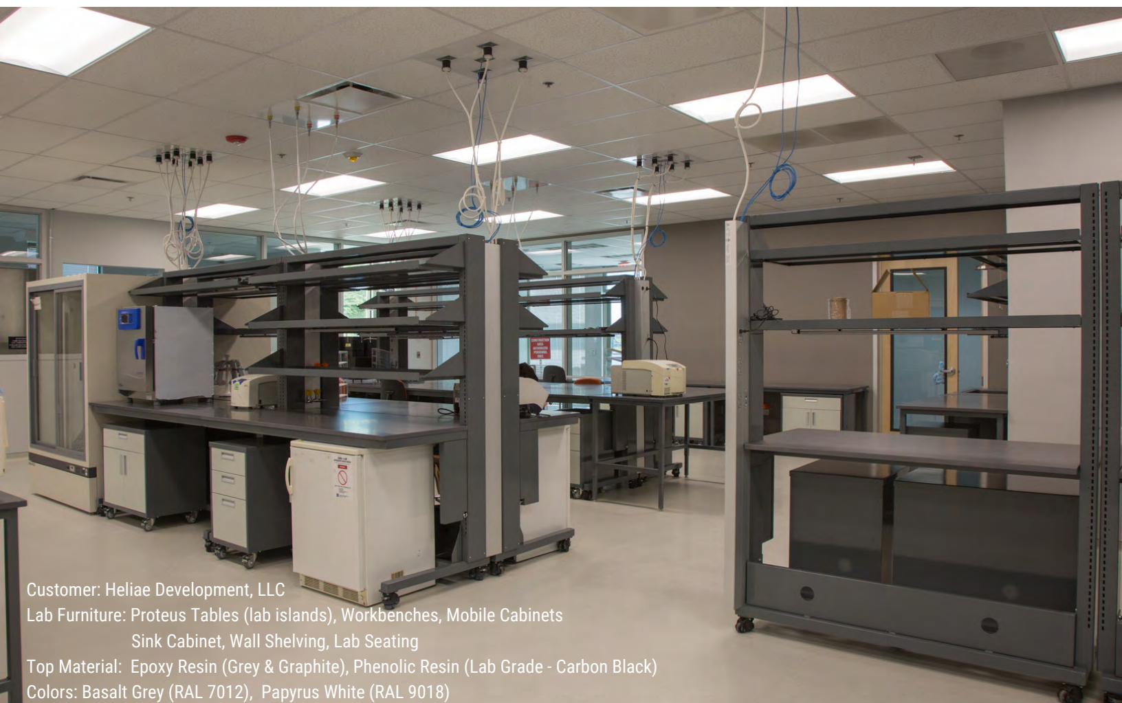
Customer: Heliae Development, LLC Lab Furniture: Proteus Tables (lab islands), Workbenches, Mobile Cabinets Sink Cabinet, Wall Shelving, Lab Seating Top Material: Epoxy Resin (Grey & Graphite), Phenolic Resin (Lab Grade - Carbon Black) Colors: Basalt Grey (RAL 7012), Papyrus White (RAL 9018)