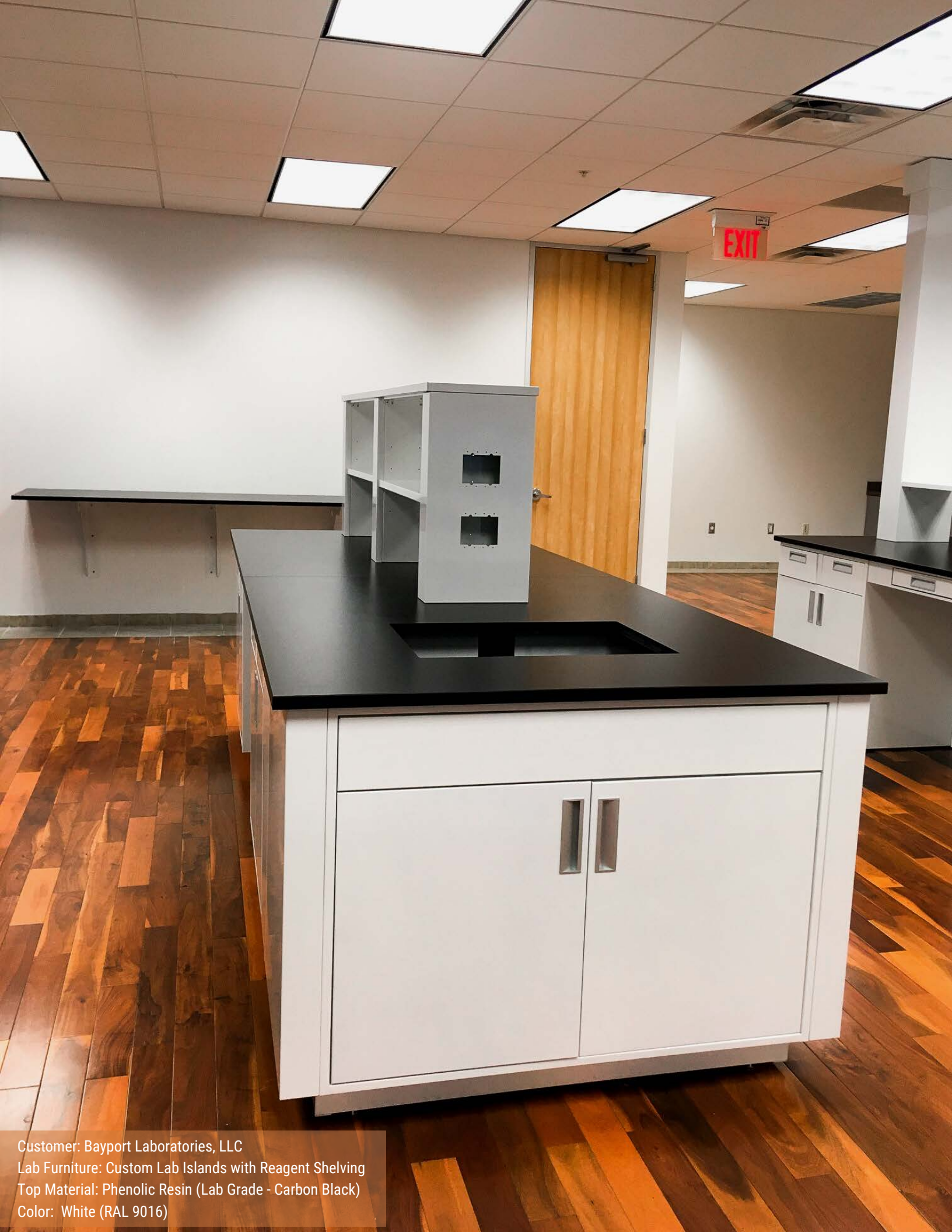
Customer: Bayport Laboratories, LLC Lab Furniture: Custom Lab Islands with Reagent Shelving Top Material: Phenolic Resin (Lab Grade - Carbon Black) Color: White (RAL 9016)