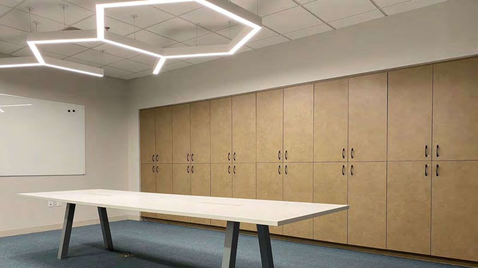
Customer: Aelgea BioTherapeutics Top Picture: Plastic Laminate Casework Bottom Picture : Plastic Laminate Casework with Stainless Countertops