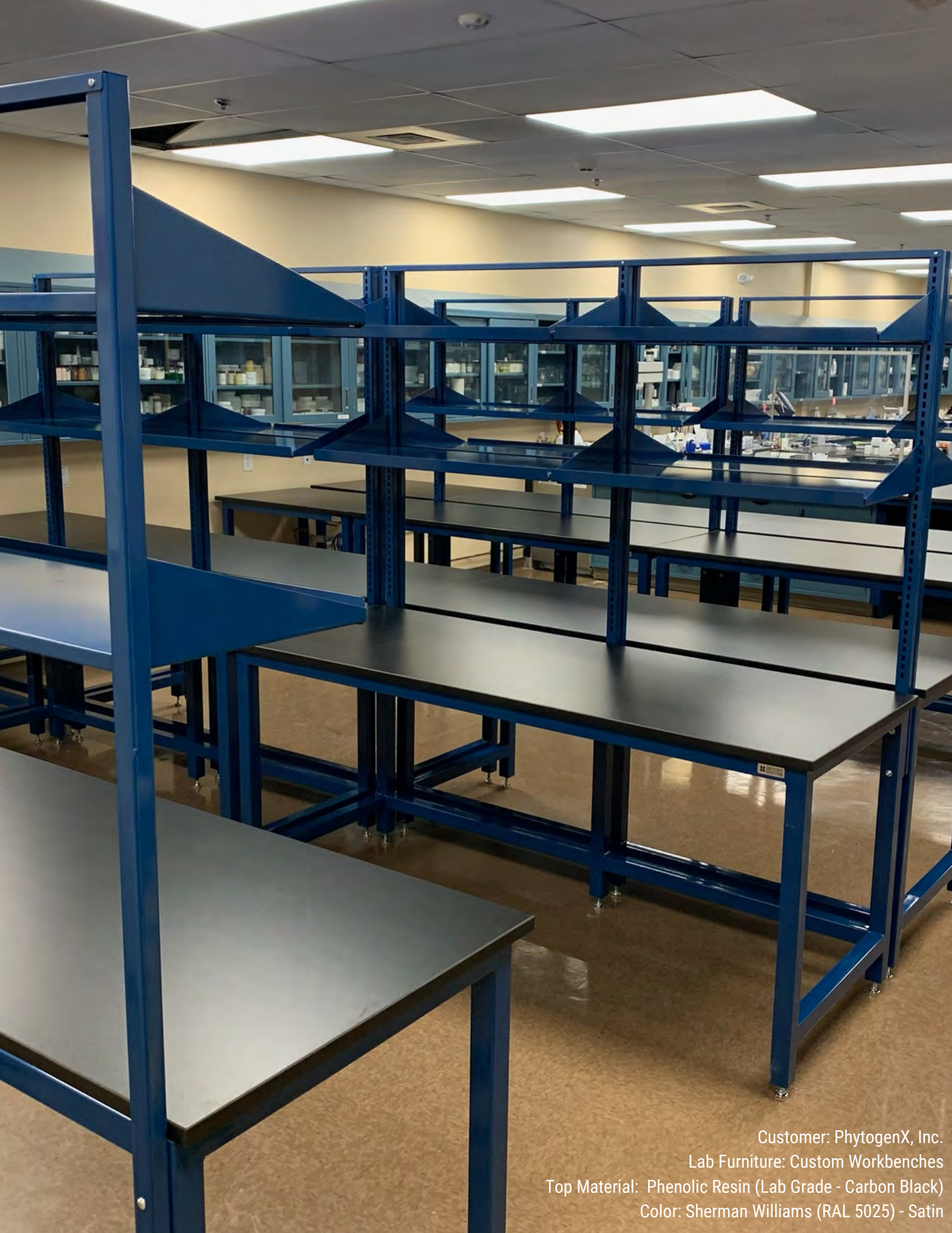
Customer: PhytogenX, Inc. Lab Furniture: Custom Workbenches Top Material: Phenolic Resin (Lab Grade - Carbon Black) Color: Sherman Williams (RAL 5025) - Satin