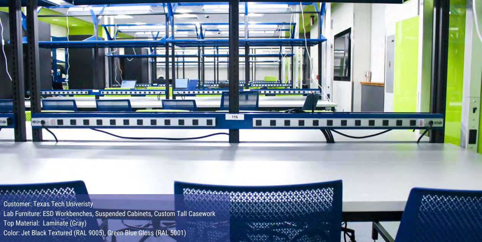
Customer: Texas Tech Univeristy Lab Furniture: ESD Workbenches, Suspended Cabinets, Custom Tall Casework Top Material: Laminate (Gray) Color: Jet Black Textured (RAL 9005), Green Blue Gloss (RAL 5001)