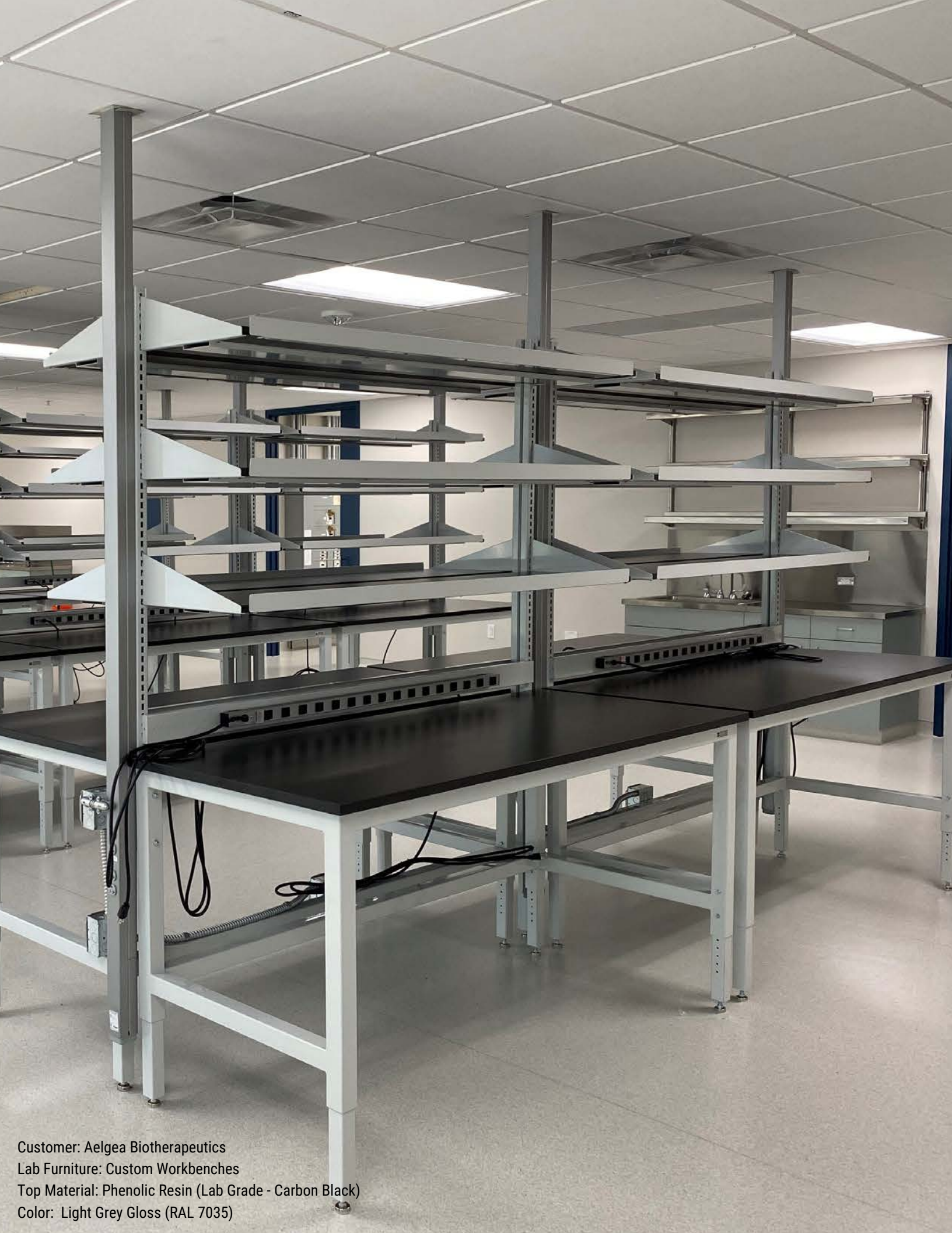
Customer: Aelgea Biotherapeutics Lab Furniture: Custom Workbenches Top Material: Phenolic Resin (Lab Grade - Carbon Black) Color: Light Grey Gloss (RAL 7035)