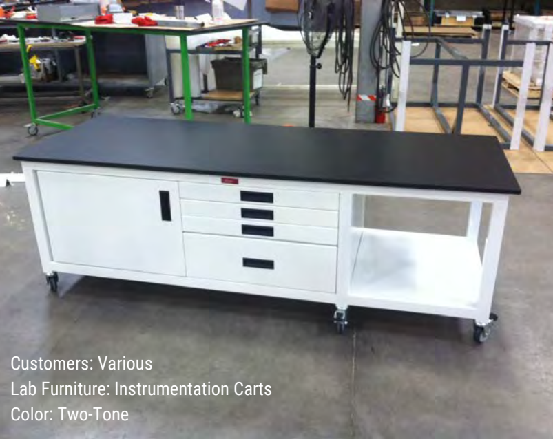
Customers: Various Lab Furniture: Instrumentation Carts Color: Two-Tone