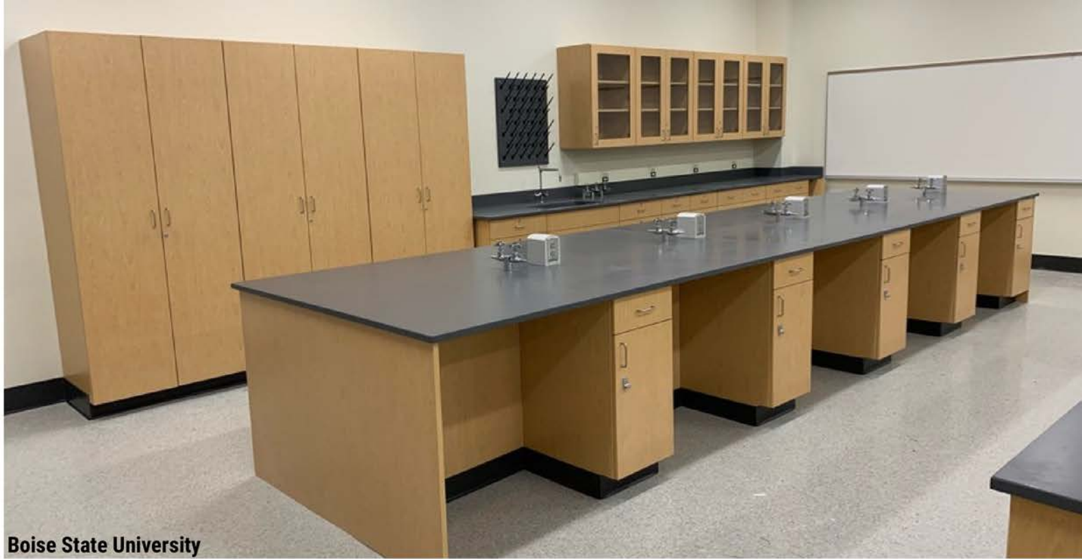
Boise State University