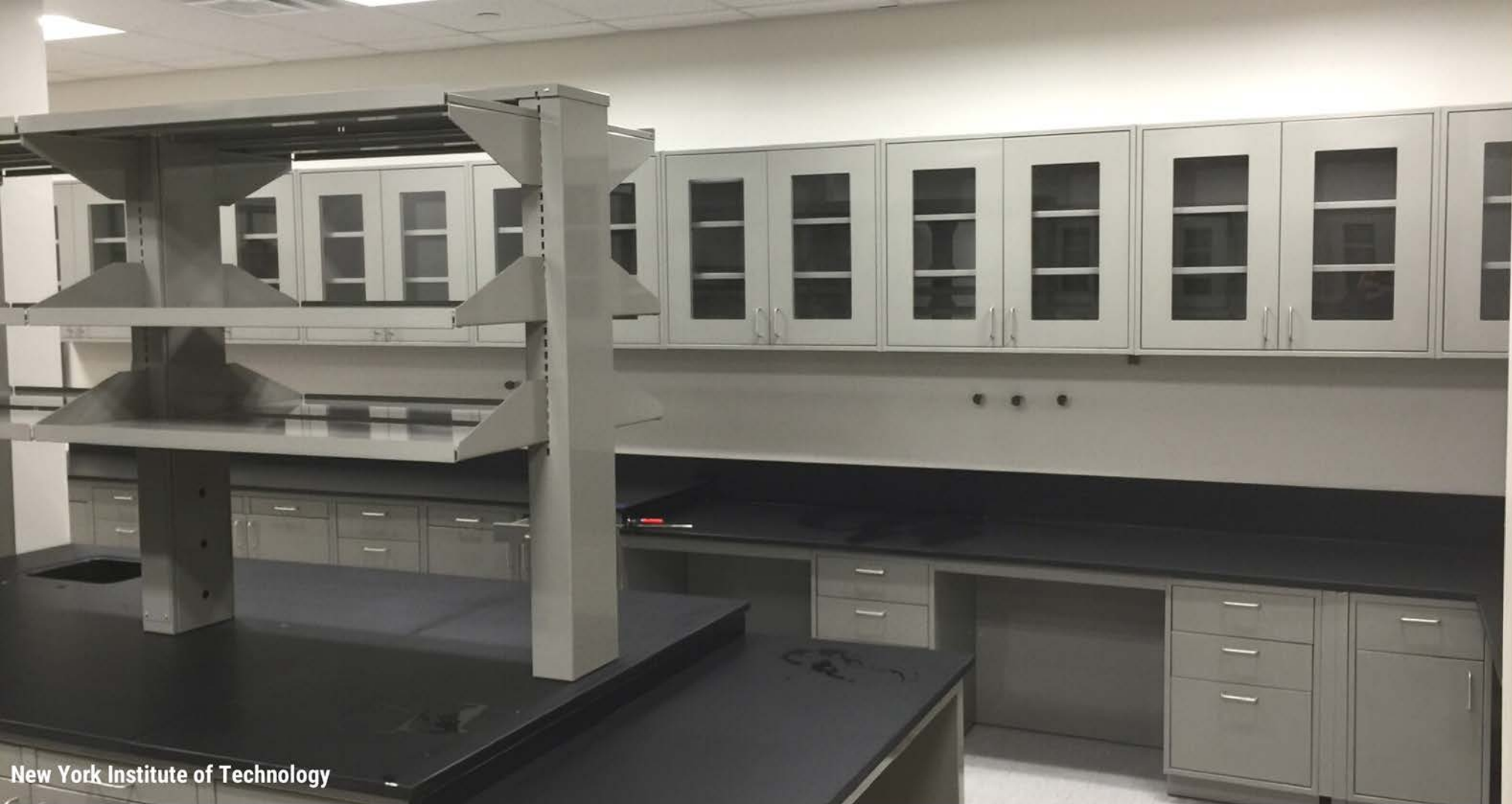
New York Institute of Technology