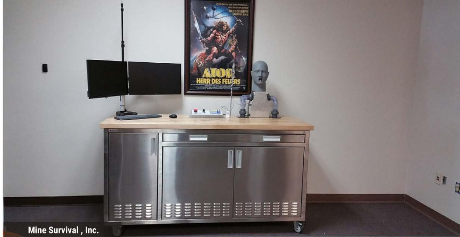
Mine Survival , Inc.