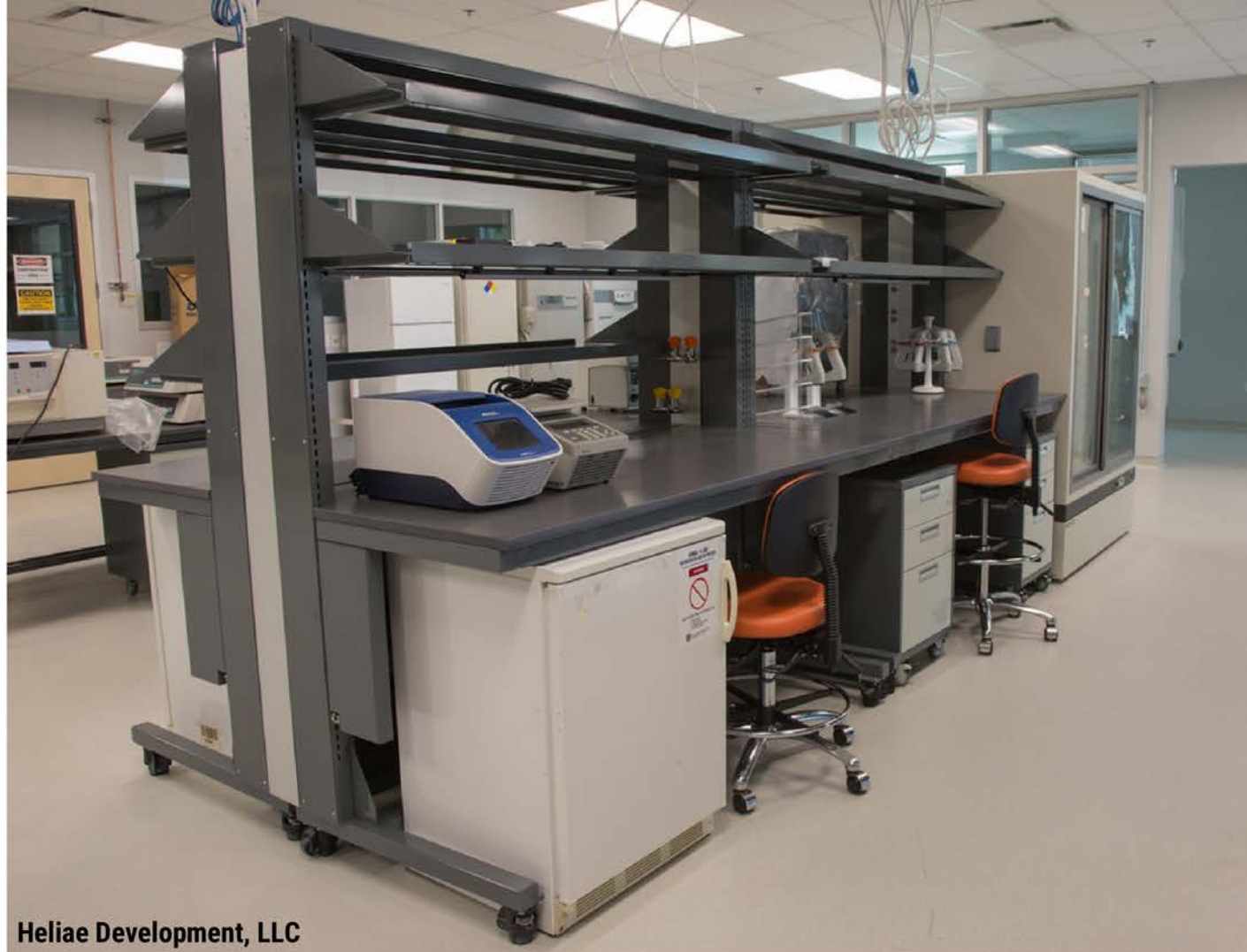
Heliae Development, LLC