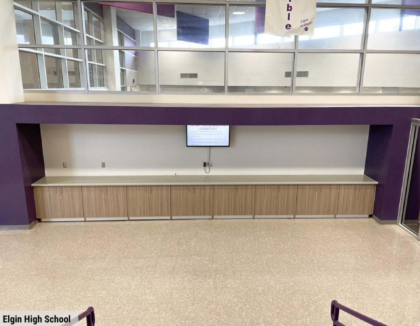
Elgin High School