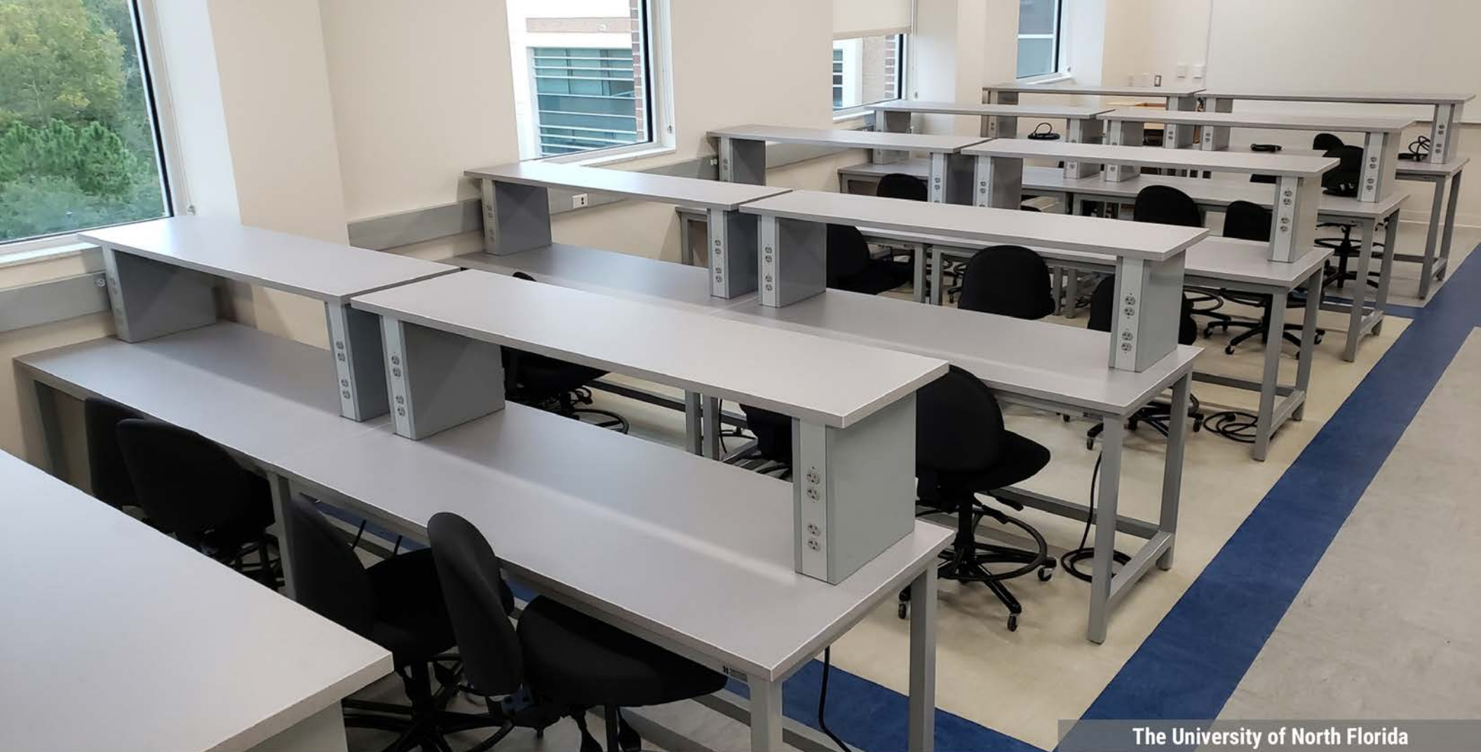
The University of North Florida